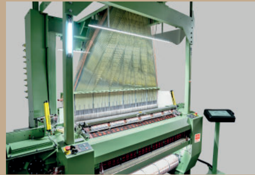
Light barrier and MLC touch panel