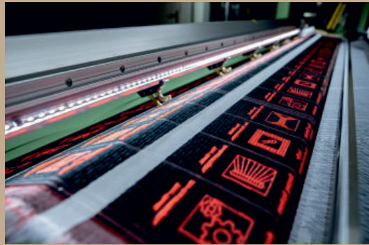
Slitting device with LED lighting